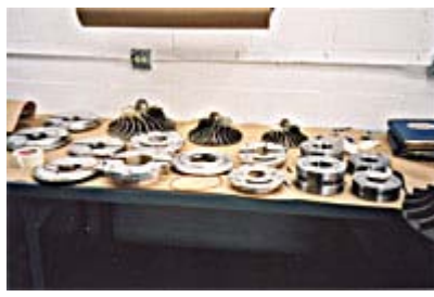
SEALS, BEARINGS, IMPELLERS