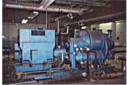
Ingersoll-Rand CENTAC® 2C35M4