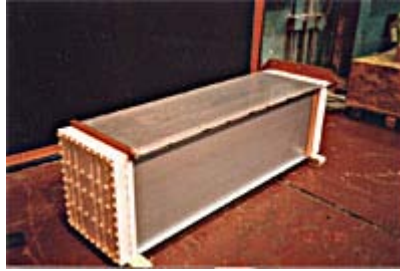
NEW COOLERS, HEAT EXCHANGERS & INTERCOOLERS