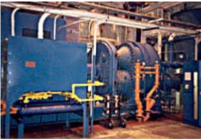
Ingersoll-Rand CENTAC® 4C110M4