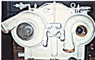
ELLIOT® PAP PLUS