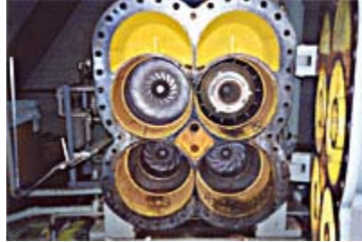
Ingersoll-Rand CENTAC® 1C21M4