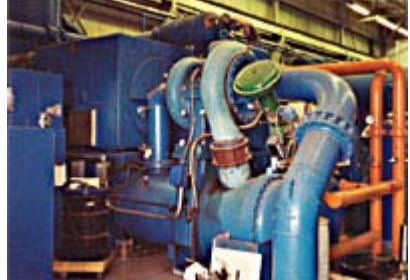
CLARK ISOPAC® 10-3-2

925 W. National Avenue, Addison, IL 60101 · Tel: 630.620.RESCO(7372) · Fax: 630.620.7335 · bngresco@aol.com