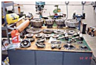
Ingersoll-Rand CENTAC® REBUILD