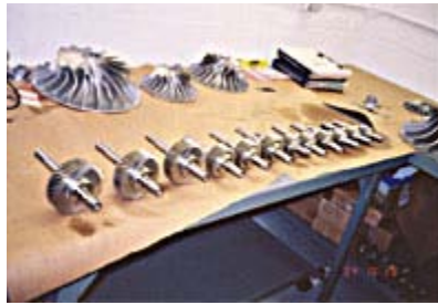
PINIONS AND IMPELLERS