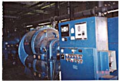
Ingersoll-Rand CENTAC® 2C55M4