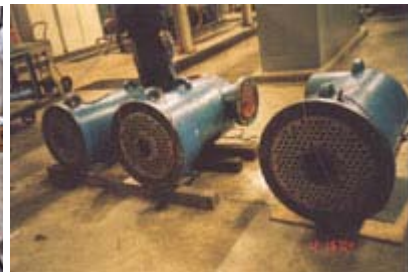
Ingersoll-Rand CENTAC® COOLER REPAIRS

925 W. National Avenue, Addison, IL 60101 · Tel: 630.620.RESCO(7372) · Fax: 630.620.7335 · bngresco@aol.com