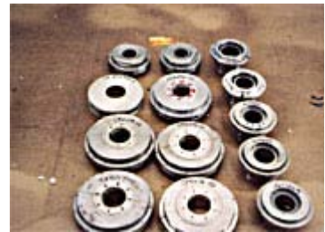
ELLIOTT® BEARINGS & SEALS

925 W. National Avenue, Addison, IL 60101 · Tel: 630.620.RESCO(7372) · Fax: 630.620.7335 · bngresco@aol.com