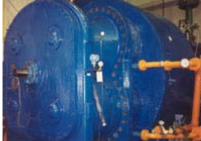
Ingersoll-Rand CENTAC® 4C150M4