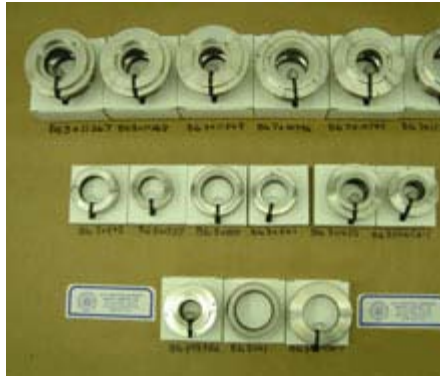
Ingersoll-Rand CENTAC® SEALS