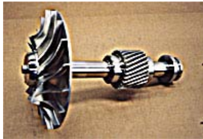
NEW ROTOR ASSEMBLIES