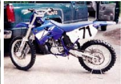
Joe's 2002 YAMAHA 250 YZ