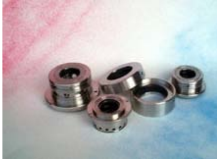
Ingersoll-Rand CENTAC® SEALS