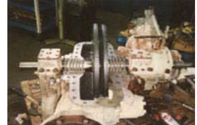
ELLIOT® YR TURBINE