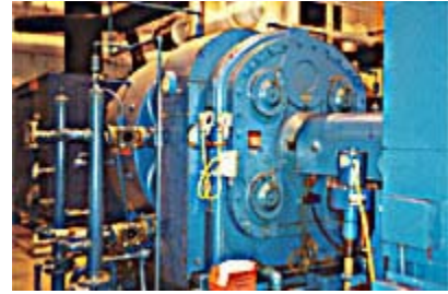
Ingersoll-Rand CENTAC® 3C90M4