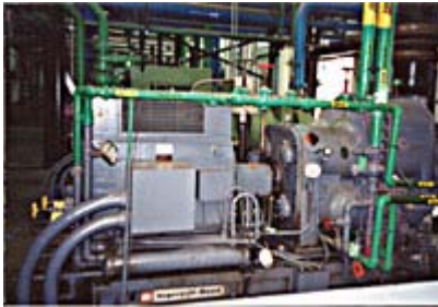
Ingersoll-Rand CENTAC® 2C45M4