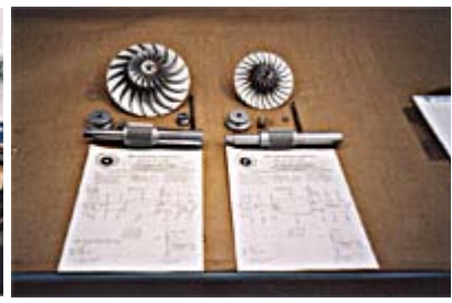
REBUILD ROTOR ASSEMBLIES