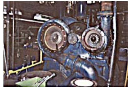
CLARK ISOPAC® 6-3-2