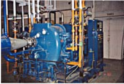
Ingersoll-Rand CENTAC® 1C27M4

Whether your rental or leased air compressor needs to be 100HP or up to 3500HP, short term or long term, B&G Rotating Equipment Service Company, Inc. can provide for your best interest.