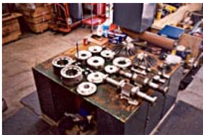
CLARK ISOPAC® REBUILD