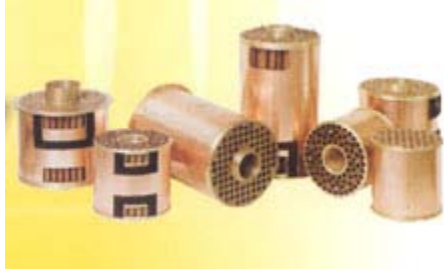
NEW CENTAC® COOLERS