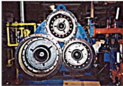
Ingersoll-Rand CENTAC® 3CII80M3