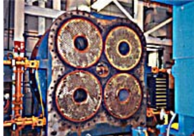
Ingersoll-Rand CENTAC® 4C150M4