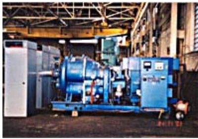
Ingersoll-Rand CENTAC® 2C50M4