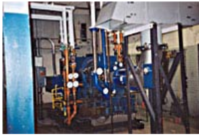
Ingersoll-Rand CENTAC® 1C30M4